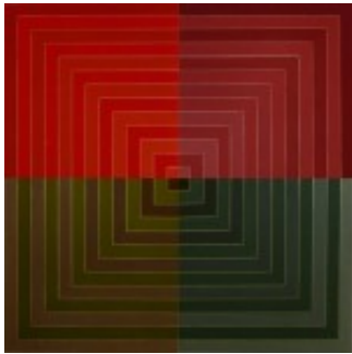
Wavelength (1980) Four panels each 99cm x 99cm, hanging variable Mixed technique on hardboard