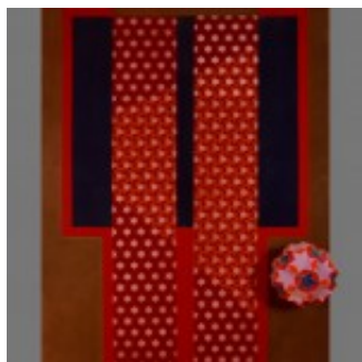
Astro-Fragment I – Soft Logic (1982) mixed technique on cotton, painted cardboard object 180cm x 240cm