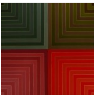
Wavelength (1980) Four panels each 99cm x 99cm, hanging variable Mixed technique on hardboard