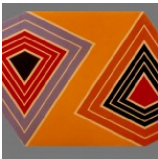
A System of Double Insecurity (1980) acrylic on cotton on board 185cm x 96cm