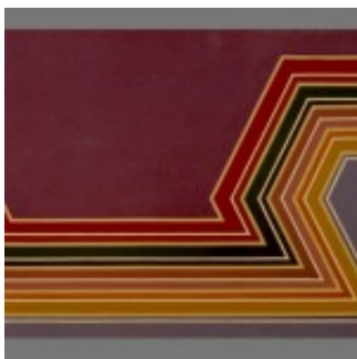
Memorial to the Flat Earth Society (1980) mixed technique on cotton 214cm x 107cm