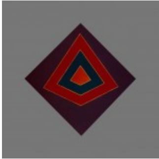
The Distant Edge (1979) alkyd on cotton 97cm x 97cm